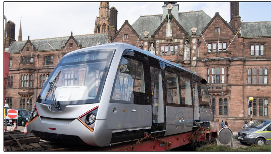
Very Light Rail

We responded to council consultations on the draft Householder Design Guide and plans for the first stage of the Very Light Rail line, from the station to lkea. We also responded to consultations on the welcome policy of introducing Article 4 Directions covering houses in multiple occupation (HMOs).