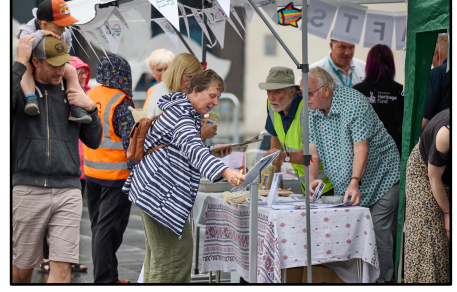
Sherbourne River Festival, Millennium Place

Unfortunately, we were not blessed with good weather.