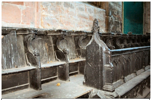
Old chancel : some of the forty-nine I5th century carved oak stalls

For years the Old Grammar School has been on the register of 'building at risk' but at last it's part of an £8.5m redevelopment secured by Coventry Transport Museum In addition, the 12th century Old Grammar School will be sympathetically conserved, revitalised and brought back into public use as an exhibition, event an