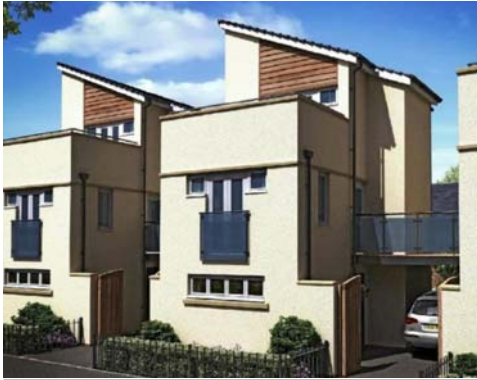
Building types: One of the designs submitted for 2, 2½ and 3 storey living

An application for the former Corporation Depot site off Foleshill Road has just been posted as we go to press. Produced by Barratt Homes with a mixture of the firm's standard developer house types and a smattering of timber cladding that is claimed to reflect Electric Wharf on the other side of the canal. Several years ago Coventry Society ran a