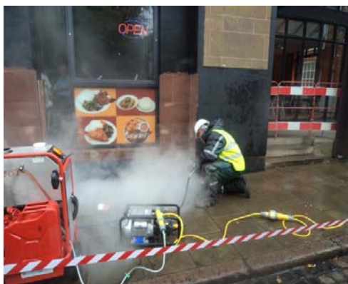
July ends: High pressure steam cleaning, appears to be producing a good result.

There was never any question of anyone being opposed to ethnic minority food outlets.