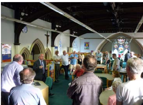
Tour: Members in the magnificent first chapel now converted into a library

convent was the church. He oversaw all aspects of its building including statues, stained glass windows and sculptures. Its most magnificent aspect is the impressive baldachin framing the altar. However, the