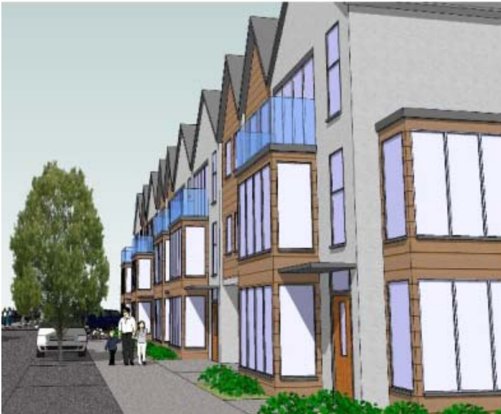
Canalside: One of the illustrations provided that's indicative of the proposals put forward